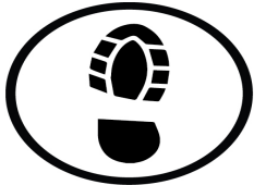
Anti - Slip / Dual Density